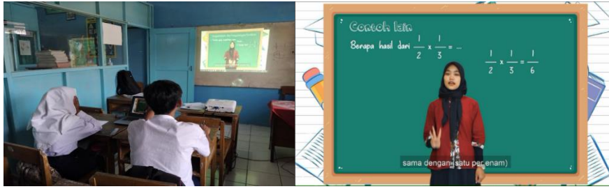
Figure 2. Media Display

The sign language used in the development of this learning video is SIBI because SIBI has been set by the government for use in extraordinary schools (SLB) (Nugraheni, Husain, & Unayah, 2021). Based on the results of the study, the use of sign language in mathematics learning in the classroom is quite good, although the obstacles are still there, but deaf students can use the communication system well during learning by looking at gestures, oral (oral movements) and writing. So that sign language learning videos are very in line with the characteristics of students.